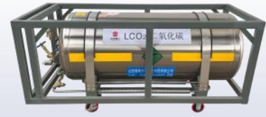
Liquid CO2 storage tank