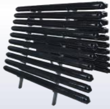
Rock breaking steel pipe