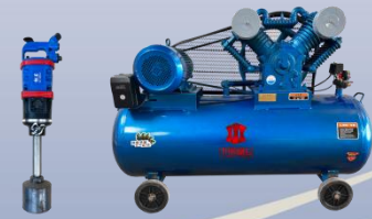
Air compressor & Air wrench